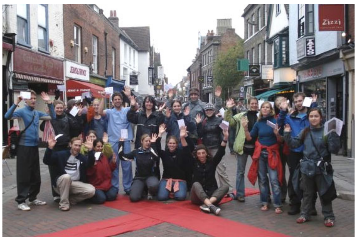
The Nobel Peace Organization International Physicians for the Prevention of Nuclear

The reason for this tour was the decision of the British parliament to renew their nuclear weapons program. Total expenses in the next thirty years including production, transport, security and maintenance of nuclear weapons will likely reach up to £70 billion. As doctors and medical students, we felt that this money would be better spent on education, health care, meeting development targets and improving social security. According to the World Court, nuclear weapons are illegal weapons of mass destruction. They are targeted primarily at the civilian population, at cities and are not to be used again after the horrible effects of the bombing of Hiroshima and Nagasaki. However, Britain is maintaining its 200 nuclear warheads, patrolling the world seas on its four vanguard submarines - each one with more firepower than hundreds of Hiroshima bombs .