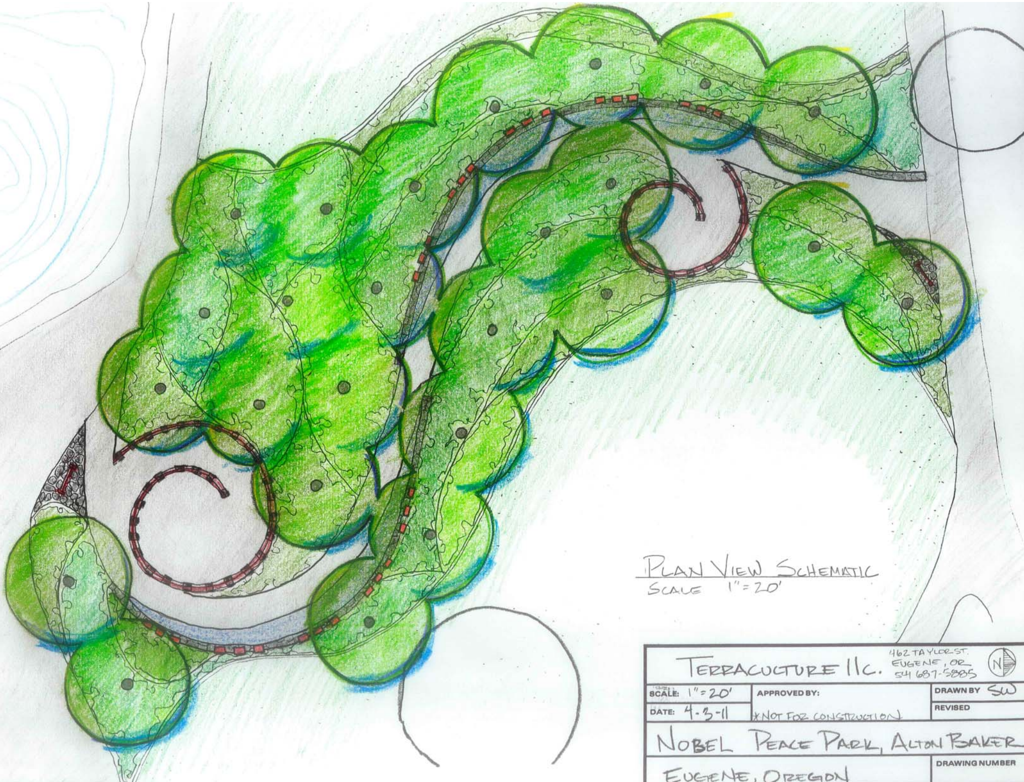
PLAN VIEW SCHEMATIC SCALE 1"=20'