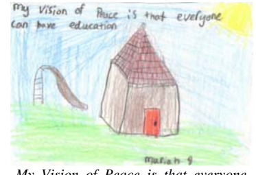
My Vision of Peace is that everyone can have education